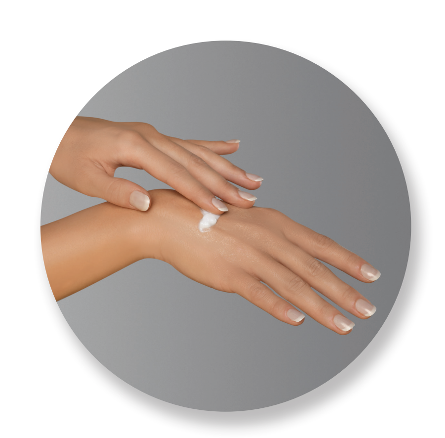
Apply blending cream to hands and feet including nails

NOTE: The FDA recommends wearing protective eyewear, nose filters, ear plugs, lip balm, and undergarments. Ask the salon staff for details.