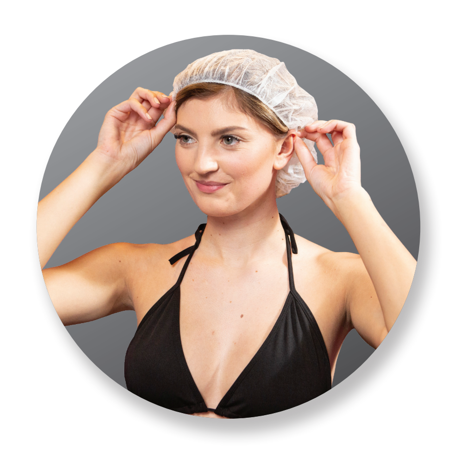
Put on haircap – leave ears and hairline exposed